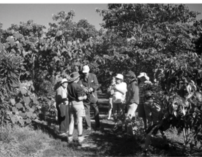
One year old trees in foreground, 3 year old behind group

A brisk walk through previous plantings from 1 to 3 years old was followed by an informative talk by environmental scientist Joe Rhodes, who designed the Tolga stormwater retention structures on the Kennedy Highway and Bones Road corner. Check it out next time you're passing through Tolga. Joe spoke passionately about the principles behind the power of rainfall, how we have changed the landscape and accelerated soil erosion and our need to manage stormwater by essentially slowing the water down, mimicking the natural precleared landscape rainfall management, allowing for ground water recharge and reducing the power of the water to erode. New regulations out last year from FNQROC mean developments must now manage the stormwater runoff directly on site with the aim of reducing soil erosion and sediment travel to the reef.