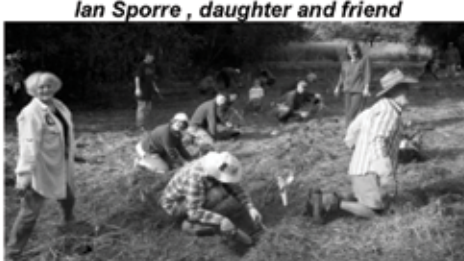
The last few plants