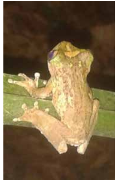
Sylvia Conway - Litoria myola

Envirocare would like to speak to any landholder whose property borders onto Jum Rum creek. With a small amount of grant funding allocated by the Federal Caring For Our Country environmental program would like to support you in enhancing your creek edge to create a frog-friendly environment. We can help to stabilise banks against soil erosion, replacing weed species with low growing natives and generally making Jum Rum creek a more friendly environment for you and for frogs. Rainforest frog species are like the canary in coal mines, their presence shows the health of our rainforest streams.