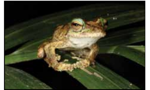
L. myola , difficult to distinguish by sight from L.germaculata but the call is distinctive

To bring awareness to our community of the health of our ecosystems and to monitor threats to these systems, we have a long term frog-monitoring project in progress, funded by the international Mohammed bin Zayed Foundation. We also received a community grant for a two year project focusing on Jum Rum Creek revegetation and community awareness