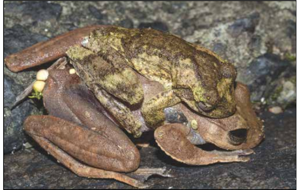
L. myola (or L. serrata) male in amplexus with Litoria dayi.

We humans are not alone ! It happens in the animal kingdom as well. Those who ventured out to the wilds of Warril creek, after our fun workshop on local frog call identification, were treated to a case of mistaken identification by the frogs themselves. Two different species of frogs mating.